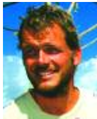
by Torgeir Sæverud Higrav