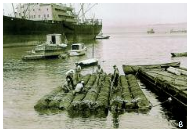
HEYERDAHL COLLECTION: STENERSENS