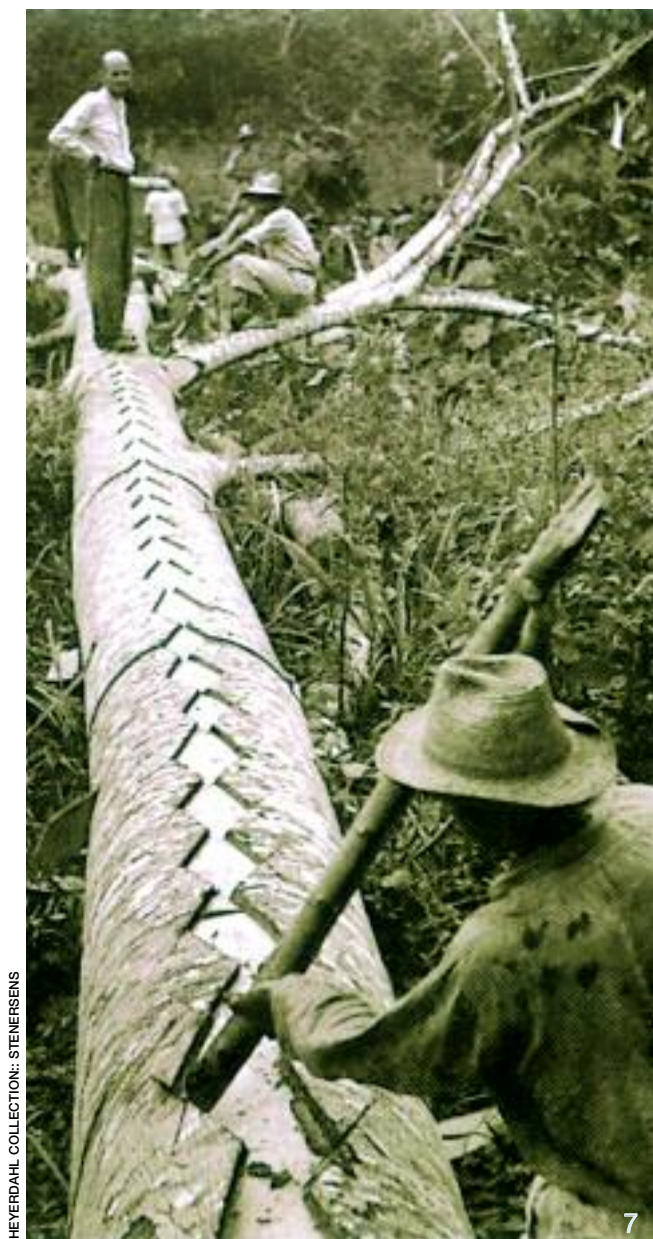
HEYERDAHL COLLECTION: STENERSENS